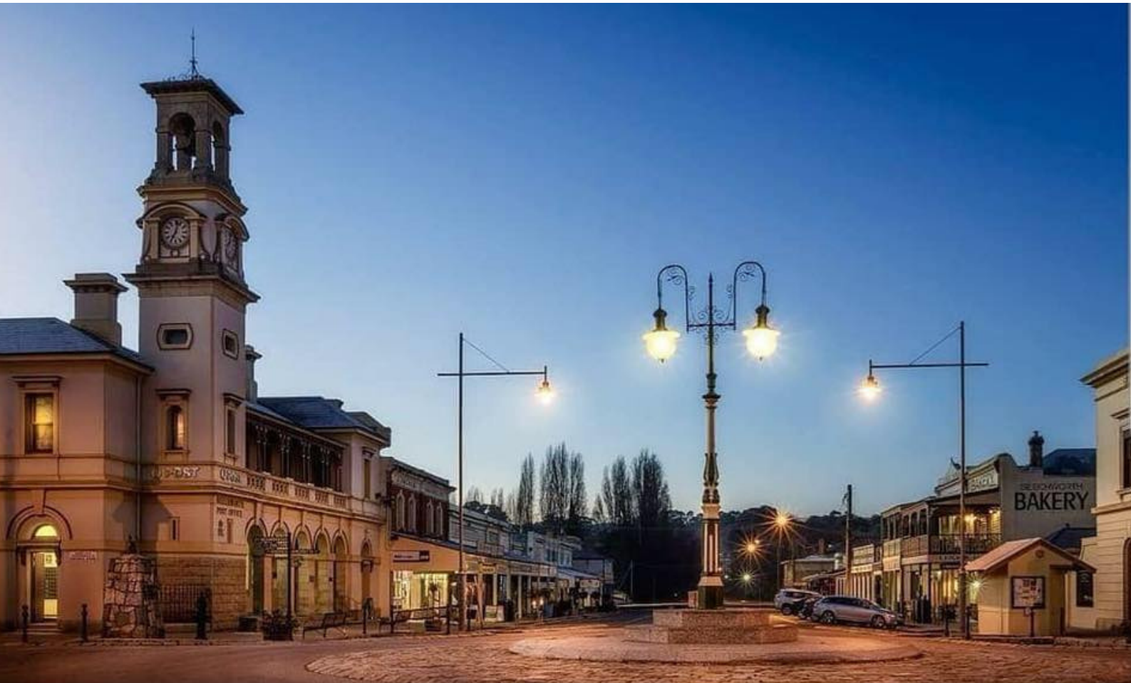
Pictured: Beechworth, Victorian Tidy Town Winner 2023